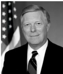
Richard A. Gephardt Director since 2005 Age 65 Retired United States Congressman

Congressman Gephardt received a Bachelor of Science degree from Northwestern University and a Juris Doctor degree from the University of Michigan Law School. After serving as a Democratic committeeman and alderman in his native St. Louis, he was elected to the United States House of Representatives in 1976, representing Missouri's Third District. He was re-elected 13 times. While in the House, Congressman Gephardt served on the Budget Committee and on the Ways and Means Committee. He was elected Chairman of the House Democratic Caucus in 1984; and he served as majority leader from 1989 to 1994. In 1994 he was elected House Democratic Leader, the top Democratic leadership position in the House. He served as minority leader from 1995 to 2003. After deciding not to seek re-election, Congressman Gephardt retired from the House on January 3, 2005. Congressman Gephardt serves as a consultant to The Goldman Sachs Group, Inc. and as senior counsel to the law firm of DLA Piper Rudnick. He serves on the board of the St. Jude Children's Hospital.