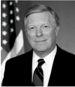
Richard A. Gephardt Age 64 Retired United States Congressman

Congressman Gephardt received a Bachelor of Science degree from Northwestern University and a Juris Doctor degree from the University of Michigan Law School. After serving as a Democratic committeeman and alderman in his native St. Louis, he was elected to the United States House of Representatives in 1976, representing Missouri's Third District. He was re-elected 13 times. While in the House, Congressman Gephardt served on the Budget Committee and on the Ways and Means Committee. He was elected Chairman of the House Democratic Caucus in 1984; and he served as majority leader from 1989 to 1994. In 1994 he was elected House Democratic Leader, the top Democratic leadership position in the House. He served as minority leader from 1995 to 2003. After deciding not to seek re-election, Congressman Gephardt retired from the House on January 3, 2005. He serves on the boards of the St. Jude Children's Hospital and the Children's Inn at the National Institutes of Health.