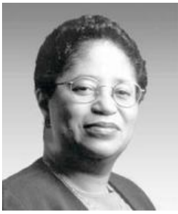
Shirley Ann Jackson Director since 2001 Age 57 President, Rensselaer Polytechnic Institute

Dr. Jackson received a BS degree in physics in 1968, and a Ph.D. in theoretical elementary particle physics in 1973, from the Massachusetts Institute of Technology. She was a research associate at the Fermi National Accelerator Laboratory, a visiting scientist at the European Center for Nuclear Research and, from 1976 to 1991, a theoretical physicist at the former AT&T Bell Laboratories. She was a professor of theoretical physics at Rutgers University from 1991 to 1995. After nomination by President Clinton and confirmation by the U.S. Senate, she was Chairman of the U.S. Nuclear Regulatory Commission from 1995 to 1999. Dr. Jackson became President of Rensselaer Polytechnic Institute in 1999. Dr. Jackson is a director of Marathon Oil Corporation, Federal Express Corporation, AT&T, Medtronic, Inc., Public Service Enterprise Group, and the New York Stock Exchange. She is a member of the National Academy of Engineering, a Fellow of the American Academy of Arts and Sciences and a Fellow of the American Physical Society. She holds 23 honorary degrees, was awarded the New Jersey Governor's Award in Science in 1993, and was inducted into the National Women's Hall of Fame in 1998. In 2003 Dr. Jackson was named by ESSENCE magazine as one of the 50 most inspiring African-Americans. She has also been named by Discover magazine as one of the top 50 women in science.